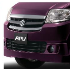
Front Fog Lamps