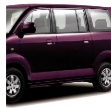
High Ground Clearance