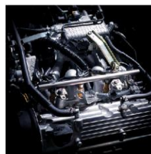
1.6 Liter, 4 Cylinder SOHC 16V Engine